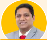
Pro Vice Chancellor, MAHE, Bangalore

Director, Kirkoskar Institute of Management (KIM), Pune