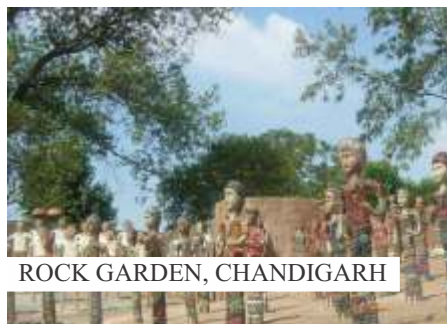
ROCK GARDEN, CHANDIGARH