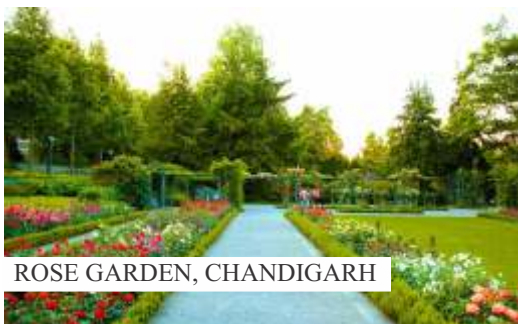
ROSE GARDEN, CHANDIGARH