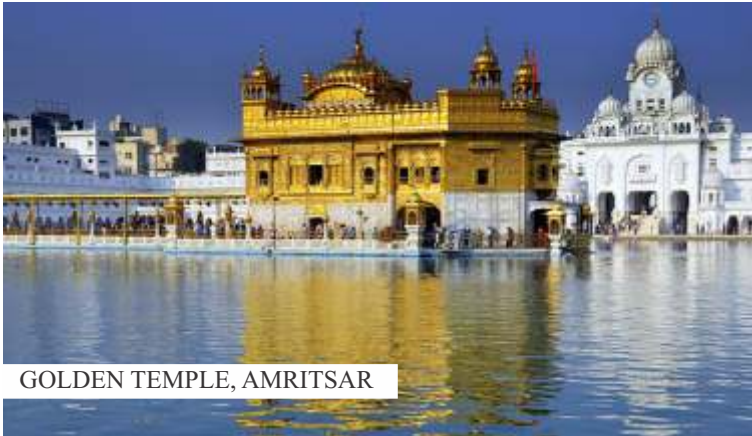
GOLDEN TEMPLE, AMRITSAR