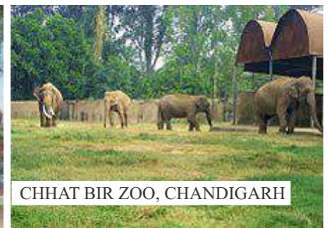
CHHAT BIR ZOO, CHANDIGARH