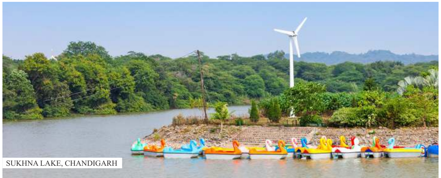
SUKHNA LAKE, CHANDIGARH