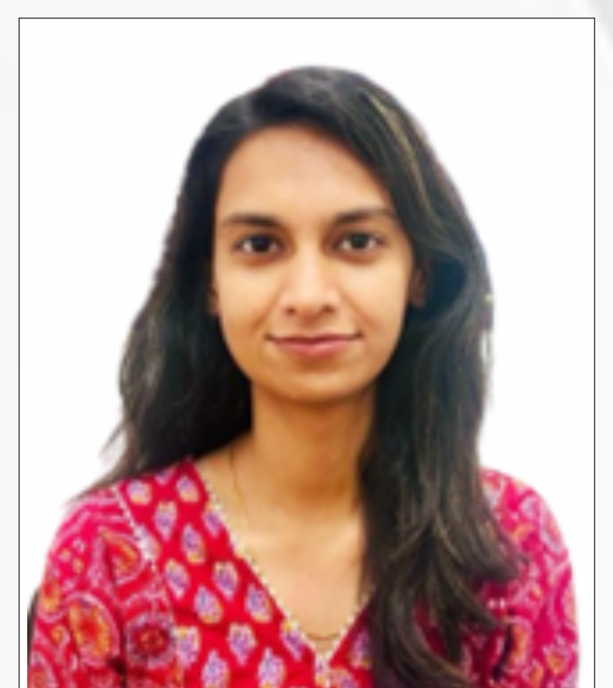
Veerta Research Scholar