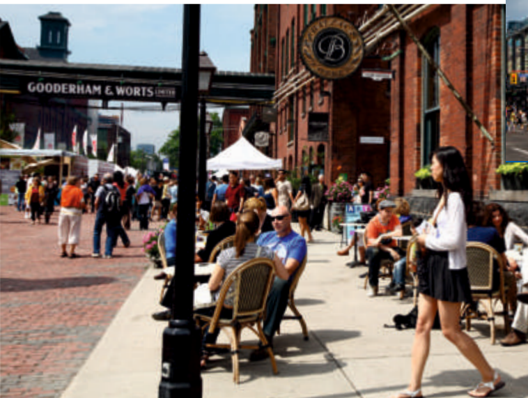
Distillery District of Toronto