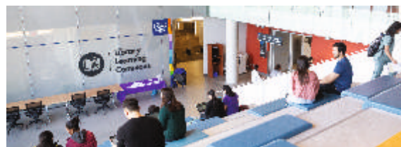
Library Learning Commons