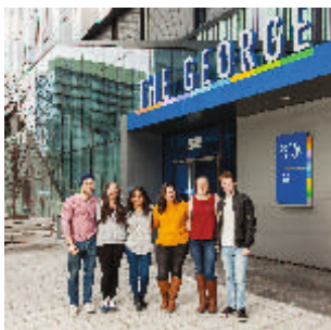
The George Student Residence

GBC is committed to making sure our international students have what they need to succeed and make the most of their experience in Canada.