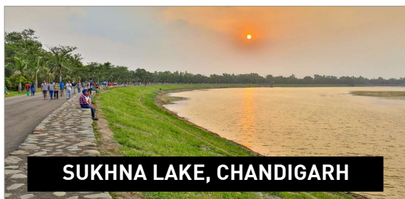
SUKHNA LAKE, CHANDIGARH

An artificial reservoir at the foothills of the Himalayas, this 3 km 2 rain-fed lake was created in 1958 by damming the Sukhna Choe, a seasonal stream descending from the Shivalik Hills. Sukhna Lake is ideal for boating and relaxation. Surrounded by a scenic promenade, it offers picturesque views, especially at sunset. It is also