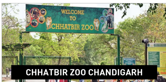
CHHATBIR ZOO CHANDIGARH

Zakir Hussain Rose Garden is a botanical garden in Chandigarh, India and spread over 30 acres of land, with 50,000 rose-bushes of 1600 different species. It's a visual treat, especially during the annual Rose Festival, showcasing vibrant blooms and providing a serene escape.