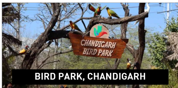
BIRD PARK, CHANDIGARH

An artificial reservoir at the foothills of the Himalayas, this 3 km 2 rain-fed lake was created in 1958 by damming the Sukhna Choe, a seasonal stream descending from the Shivalik Hills. Sukhna Lake is ideal for boating and relaxation. Surrounded by a scenic promenade, it offers picturesque views, especially at sunset. It is also