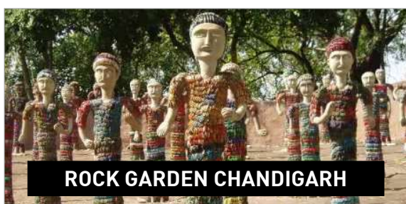
ROCK GARDEN CHANDIGARH

Situated in Sector 1, is a vibrant sanctuary dedicated to avian species. Spanning over 6.5 acres, the park features a variety of bird species, including native and migratory birds. It offers well maintained aviaries and lush green