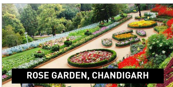
ROSE GARDEN, CHANDIGARH

Created by Nek Chand, the Rock Garden is an innovative sculpture park built from discarded materials like broken crockery, glass, and metal. Spread over 40 acres, it features whimsical, intricate sculptures, waterfalls, and labyrinthine paths, making it a unique and engaging