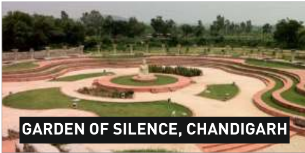
GARDEN OF SILENCE, CHANDIGARH

Situated near Sukhna Lake, this tranquil space is designed for meditation and reflection. It features a central meditation area with a Lord Buddha statue, surrounded by lush greenery and serene water bodies. The garden's peaceful ambience, enhanced by its calming environment and thoughtful design, offers visitors a quiet retreat from the city's hustle and bustle, promoting inner peace and relaxation.