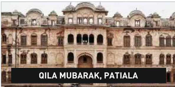
QILA MUBARAK, PATIALA

The Sector 17 Market is centrally located in the city and serves as a one-stop destination for all kinds of shoppers, dotted with stores offering branded clothing, electronics, books, and jewellery. You will find everything on your shopping list here, from traditional Punjabi dupattas and juttis to outlets of popular fashion brands, street vendors, and daily-needs shops. Visit the market in the evening to enjoy the laser and musical fountain show.