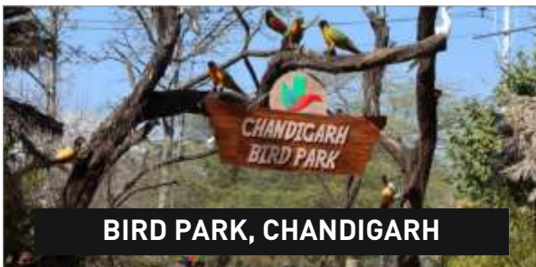
BIRD PARK, CHANDIGARH

An artificial reservoir at the foothills of the Himalayas, this 3 km 2 rain-fed lake was created in 1958 by damming the Sukhna Choe, a seasonal stream descending from the Shivalik Hills. Sukhna Lake is ideal for boating and relaxation. Surrounded by a scenic promenade, it offers picturesque views, especially at sunset. It is also a popular spot for picnics, morning walks, and birdwatching.