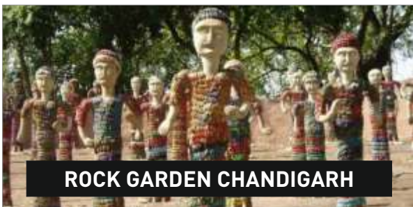
ROCK GARDEN CHANDIGARH

Situated in Sector 1, is a vibrant sanctuary dedicated to avian species. Spanning over 6.5 acres, the park features a variety of bird species, including native and migratory birds. It offers well maintained aviaries and lush green surroundings, making it an ideal spot for birdwatching and nature enthusiasts.