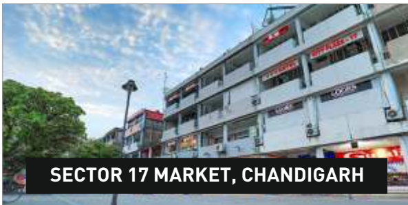
SECTOR 17 MARKET, CHANDIGARH

Situated near Sukhna Lake, this tranquil space is designed for meditation and reflection. It features a central meditation area with a Lord Buddha statue, surrounded by lush greenery and serene water bodies. The garden's peaceful ambience, enhanced by its calming environment and thoughtful design, offers visitors a quiet retreat from the city's hustle and bustle, promoting inner peace and relaxation.