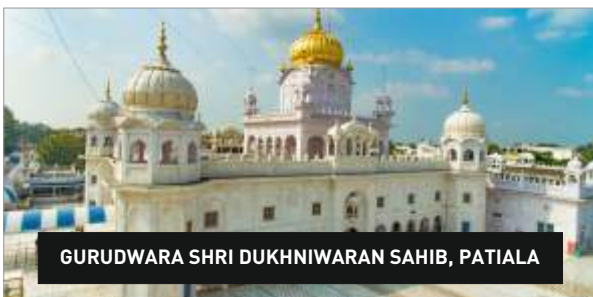
GURUDWARA SHRI DUKHNIWARAN SAHIB, PATIALA

This historic fortress and palace complex in Patiala features a blend of Mughal and Rajput architectural styles and dates back to the 18th century. It is about 25 km from the campus.