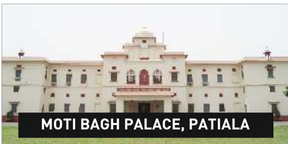
MOTI BAGH PALACE, PATIALA

A revered Sikh temple in Patiala known for its spiritual atmosphere, intricate architecture, and a holy pond believed to have healing properties.