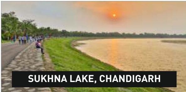
SUKHNA LAKE, CHANDIGARH

An artificial reservoir at the foothills of the Himalayas, this 3 km 2 rain-fed lake was created in 1958 by damming the Sukhna Choe, a seasonal stream descending from the Shivalik Hills. Sukhna Lake is ideal for boating and relaxation. Surrounded by a scenic promenade, it offers picturesque views, especially at sunset. It is also a popular spot for picnics, morning walks, and birdwatching.