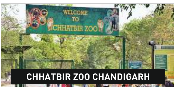
CHHATBIR ZOO CHANDIGARH

Zakir Hussain Rose Garden is a botanical garden in Chandigarh, India and spread over 30 acres of land, with 50,000 rose-bushes of 1600 different species. It's a visual treat, especially during the annual Rose Festival, showcasing vibrant blooms and providing a serene escape.