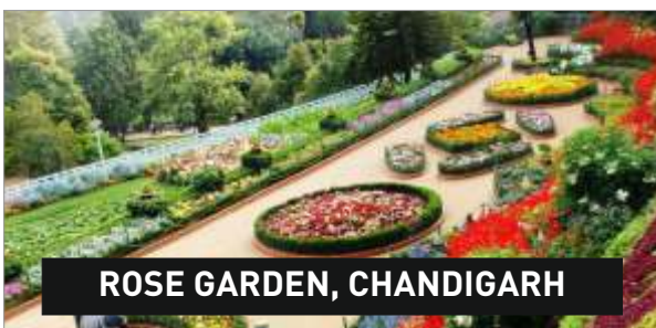
ROSE GARDEN, CHANDIGARH

Created by Nek Chand, the Rock Garden is an innovative sculpture park built from discarded materials like broken crockery, glass, and metal. Spread over 40 acres, it features whimsical, intricate sculptures, waterfalls, and labyrinthine paths, making it a unique and engaging destination.