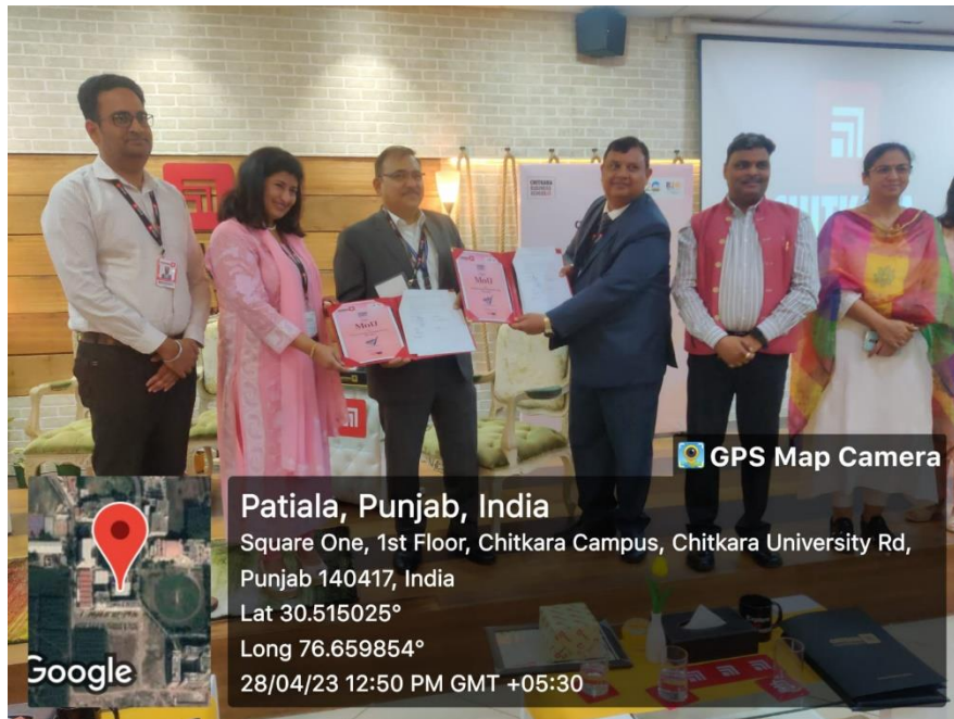
Release of MoU