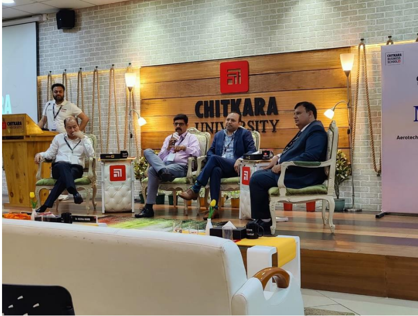
Panel 2 Discussion on Day1