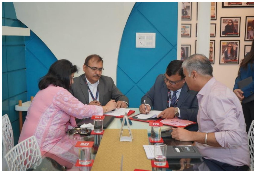
Signing of MoU