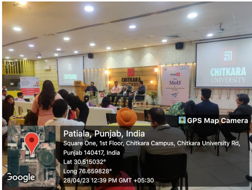
Panel 1 Discussion on Day1