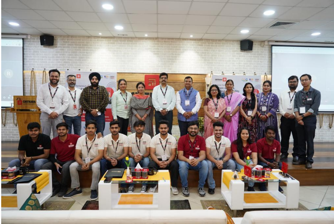
Organising Team along with Student Coordinators