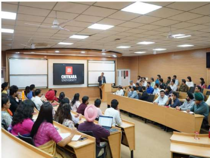
Ongoing Discussion on the Faculty Development Program