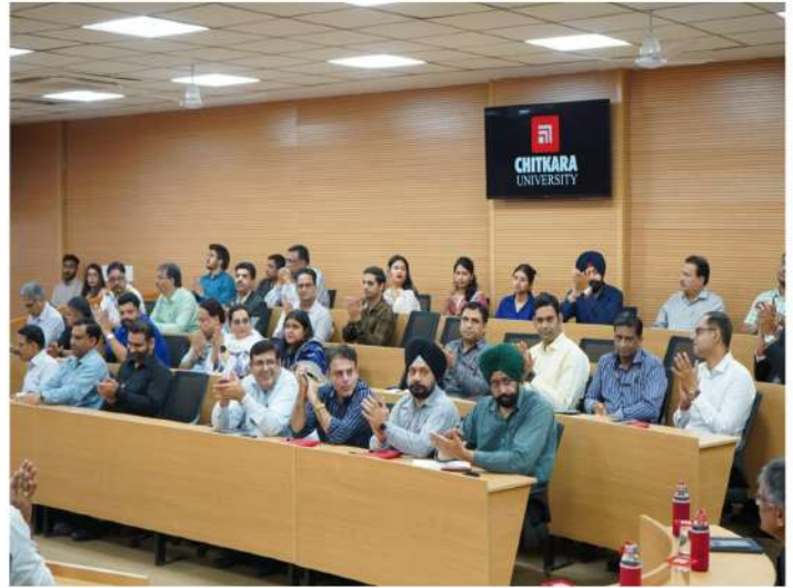
Faculty Members discussing about the Excel and Data Visualization