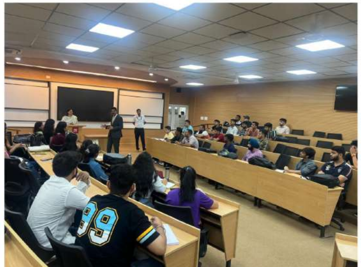
Productive interaction among participants