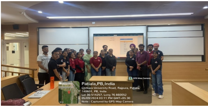
A group photograph for the first day