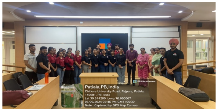
Success captured : Finishing the Tally course!