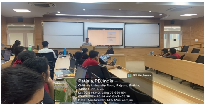
Faculty guiding students through Tally commands