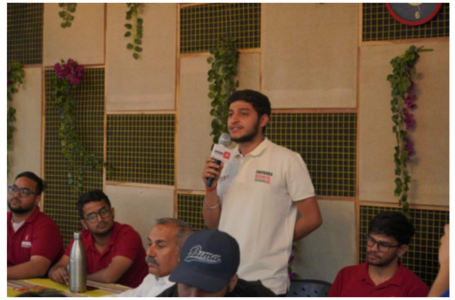
MBA SCM student raising question to the panelist