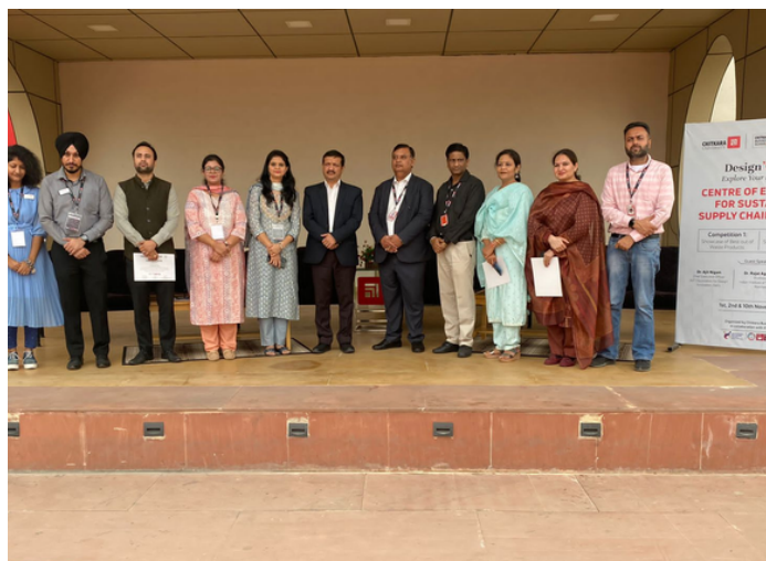
Organising Team- Design -O-Hub