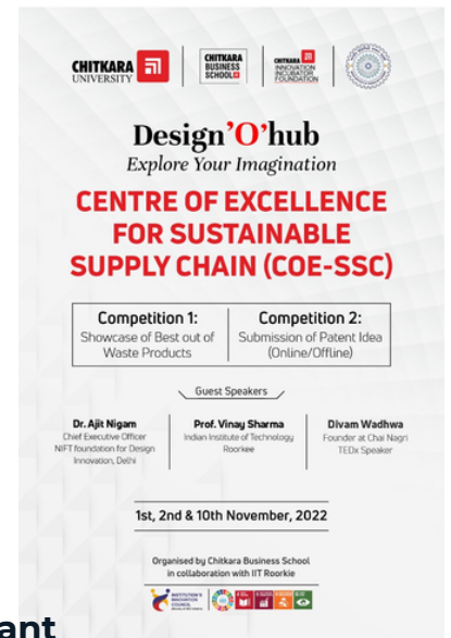
Best Out of Waste -Participant