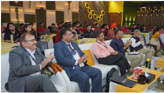
Guest in Panel Discussion