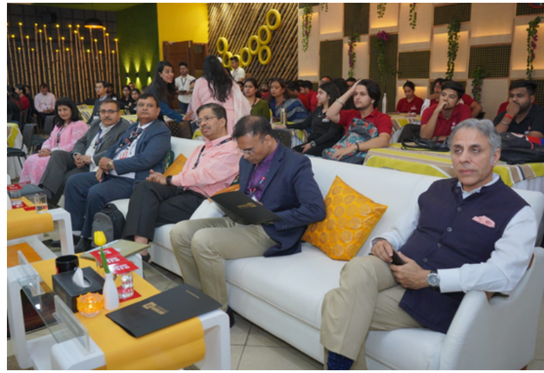
Industry Experts with Heads- CBS