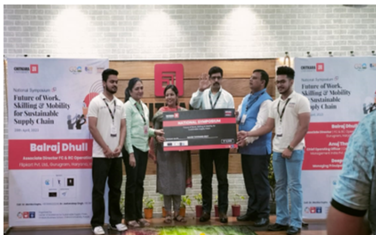
Prize Distribution with Dean SCM