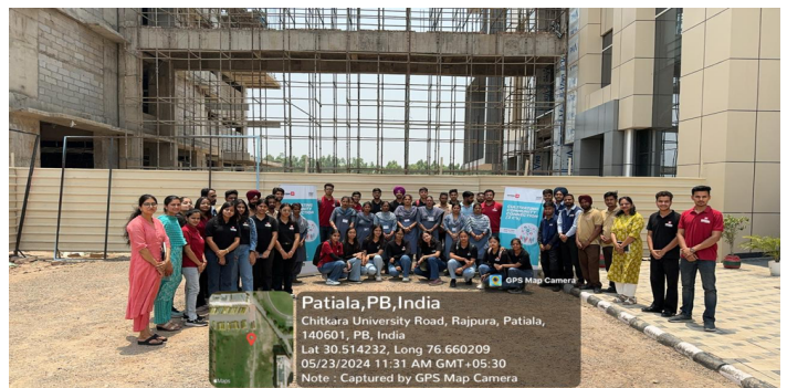
Students with faculty members participated in the event (23/05/24)