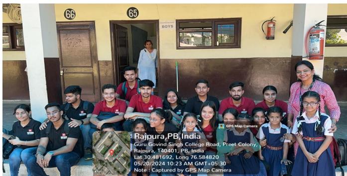
Faculty members and students with school students (23/05/24)