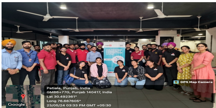
Students with faculty members in Government School, Rajpura (23/05/24)