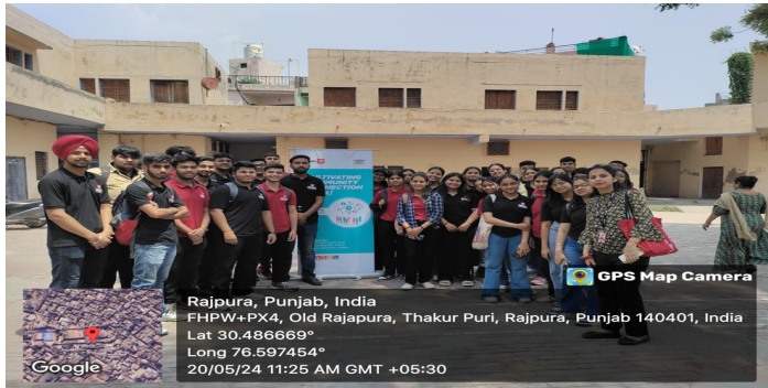
Students with faculty members in Government School, Rajpura (20/05/24)