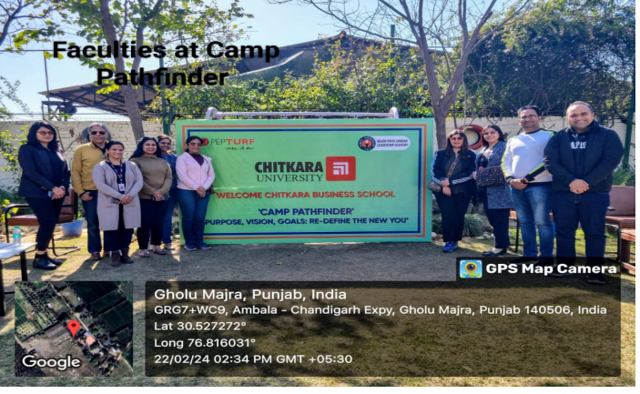
Faculties at Camp pathfinder

Camp Pathfinder (2024-02-22 to 2024-02-22) Page 2 of 2