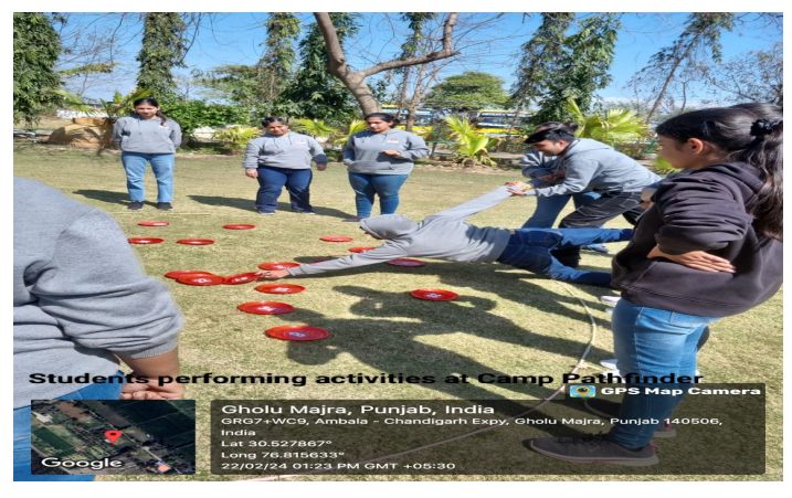
Students performing activities at Camp Pathfinder