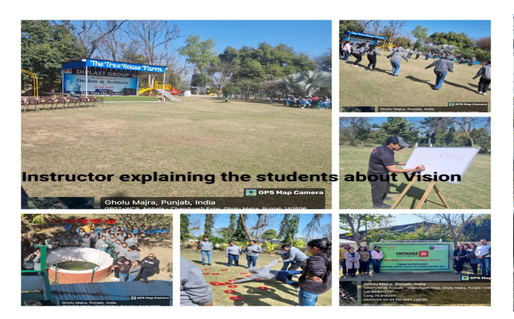
instructor explaining about the vision