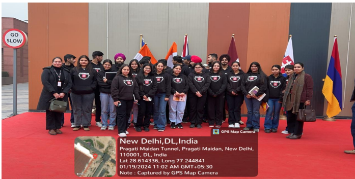
Students gathered at Fintech Expo; January 19, 2024