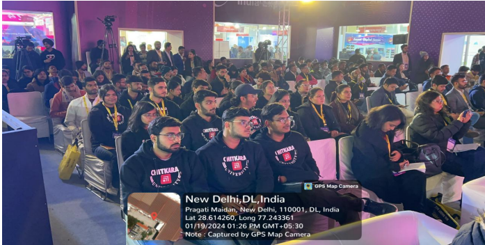
Chitkara Business School Students sitting in session on Digital Bharat; January 19, 2024