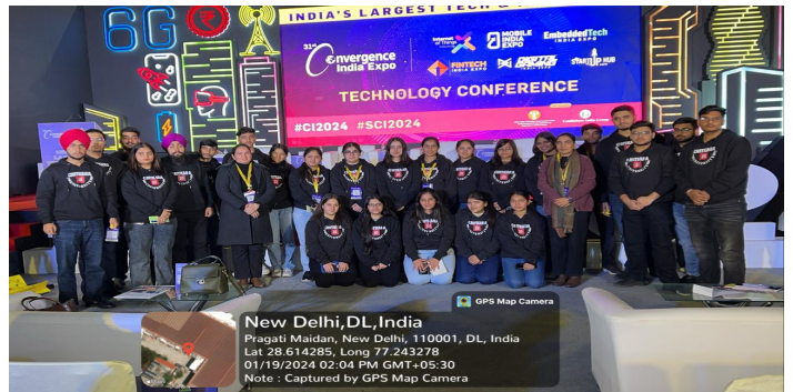
Students at panel discussion of digital lending ; January 19, 2024