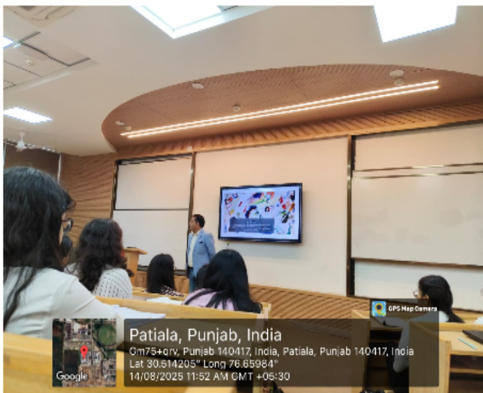
Guest taking students query on 14.08.2025