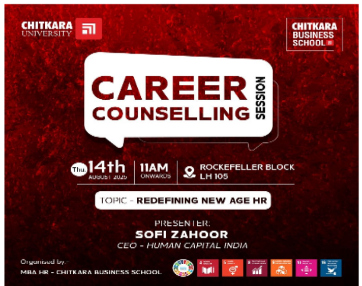
Flyer of the session dated 14.08.2025