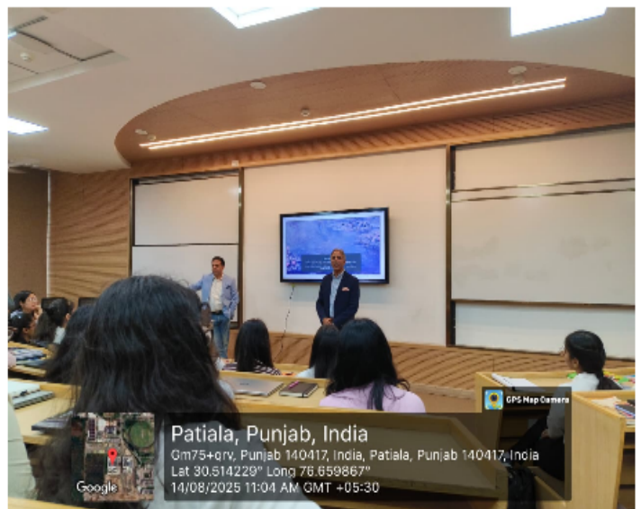
Dean HR Introducing guest to the class on 14.08.2025