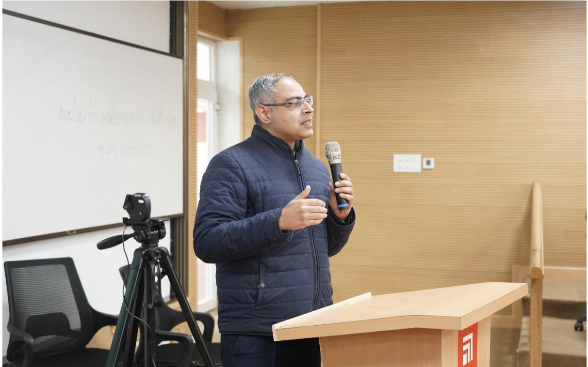
Participants shared their feedback and experience of the One-Week Faculty Development Program on 10th January, 2025