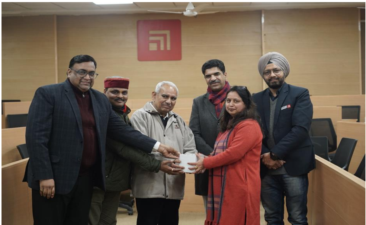
Participants were awarded with token of appreciation on successful completion of Level 1 of the One-Week Faculty Development Program on 10th January, 2025