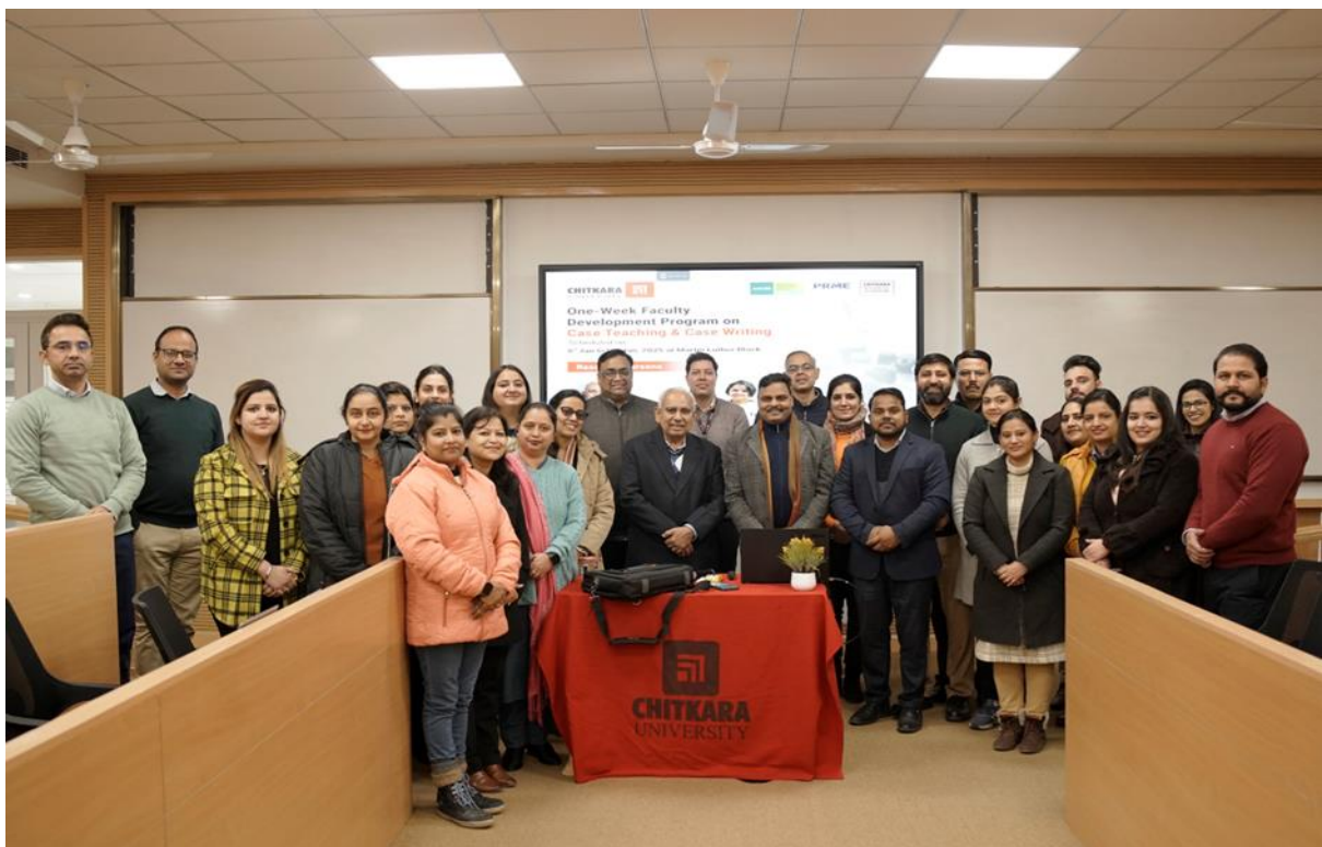
Culmination of fourth day of One-Week Faculty Development Program with a Group Photograph on 9 th January, 2025