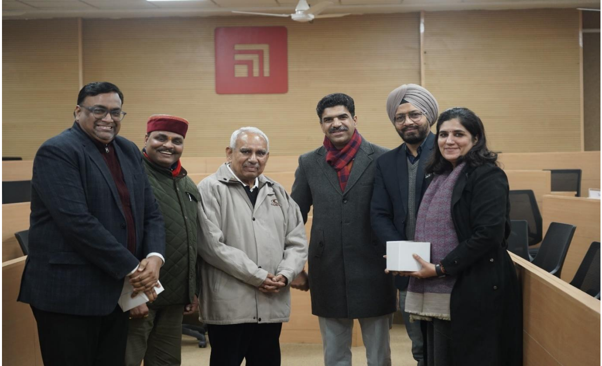
Participants were awarded with token of appreciation on successful completion of Level 1 of the One-Week Faculty Development Program on 10th January, 2025