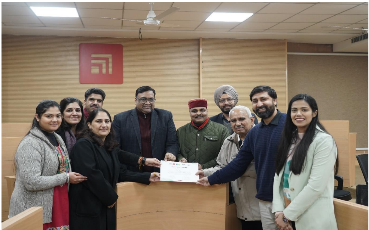
Certificate for the 'Best Team' was given to a team of five members on 10th January, 2025