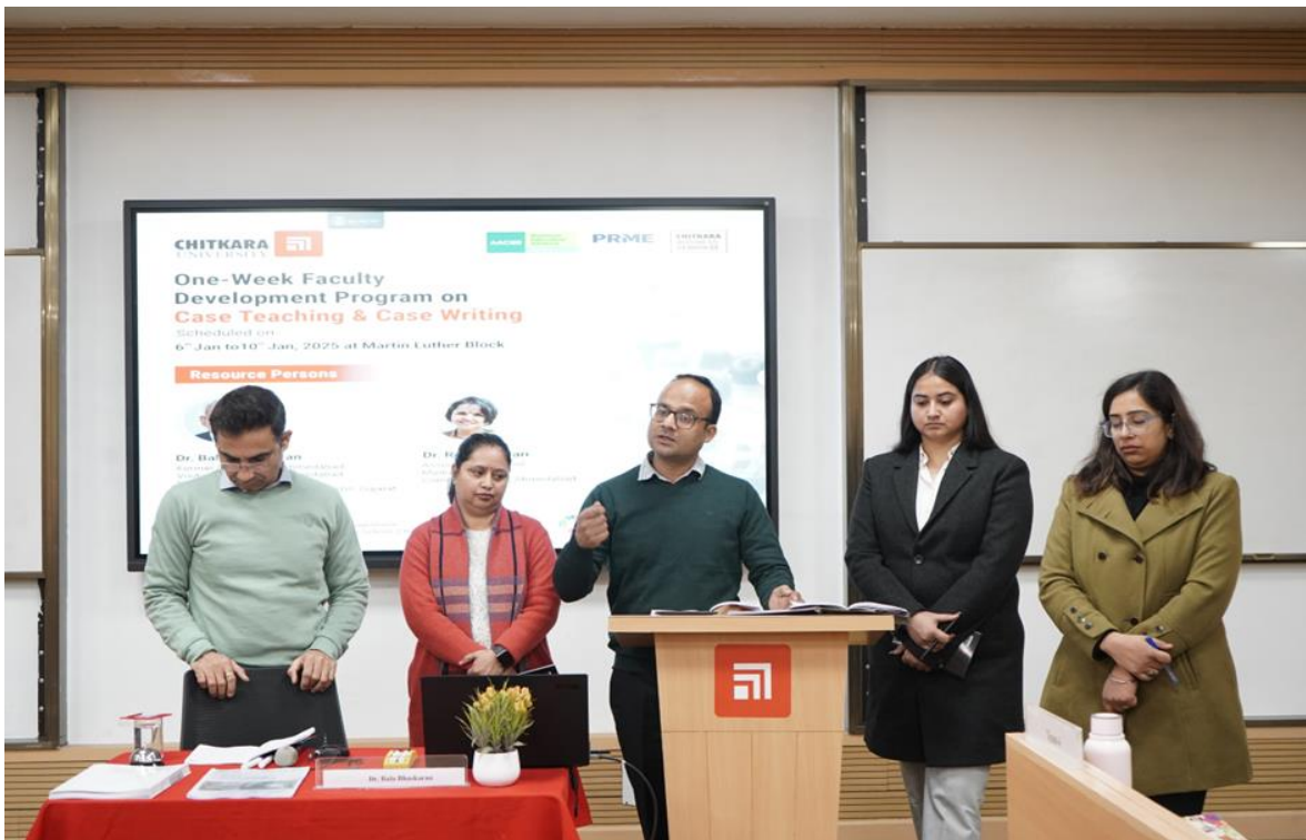
Participants collaborated in Group on Second Day of One-week of Faculty Development Program and exchanged their perspective on Case Studies on 7 th January, 2025.

The day’s engaging sessions concluded with a renowned appreciation, understanding the transformative power of case-based teaching and learning fostering critical analysis and problem-solving techniques. Day 2 of the one-week FDP enriched the participants with innovative skills to be incorporated into their everyday teaching practices. As the FDP continues, participants look forward to explore the art and science of case teaching and writing.