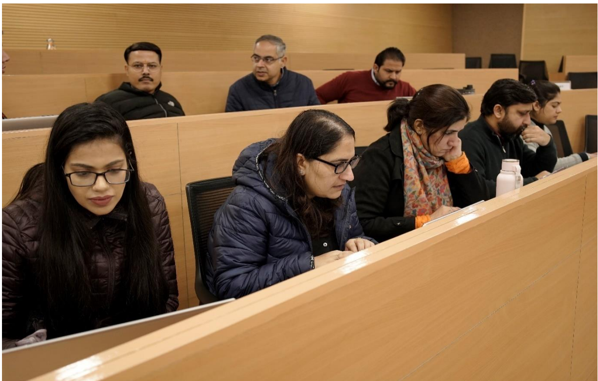
Participants collaborated in teams practiced hand on writing exercises of Case Studies on 9th January, 2025