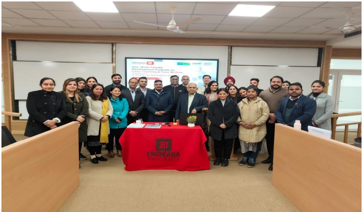
Conclusion of First Day of Faculty Development Program with a Group Photograph held on 6th January, 2025.