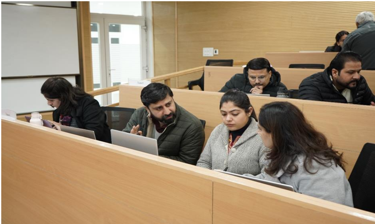
Participants collaborated in Group on Second Day of One-week of Faculty Development Program and exchanged their perspective on Case Studies on 7th January, 2025.