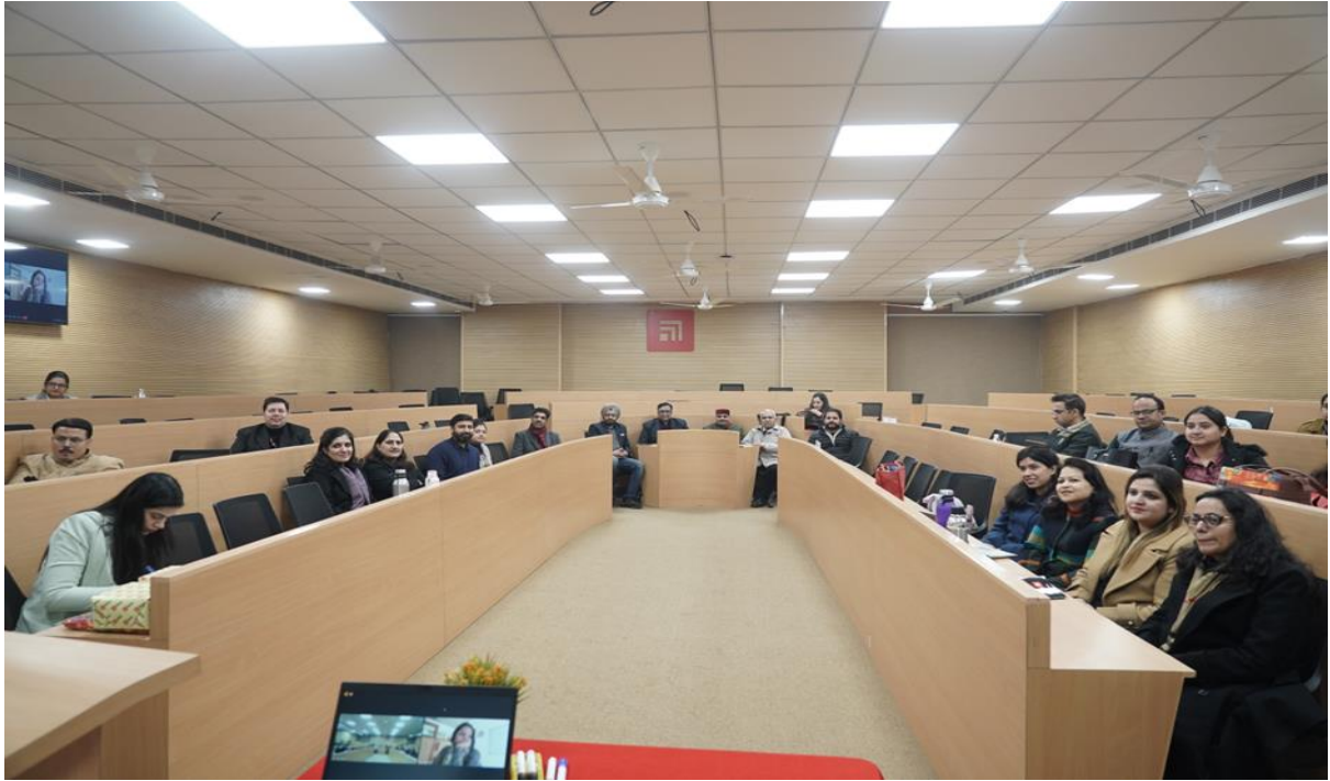
Conclusion of the One-Week Faculty Development Program on “Case Teaching and Case Writing” with a Valedictory Session on 10 th January, 2025