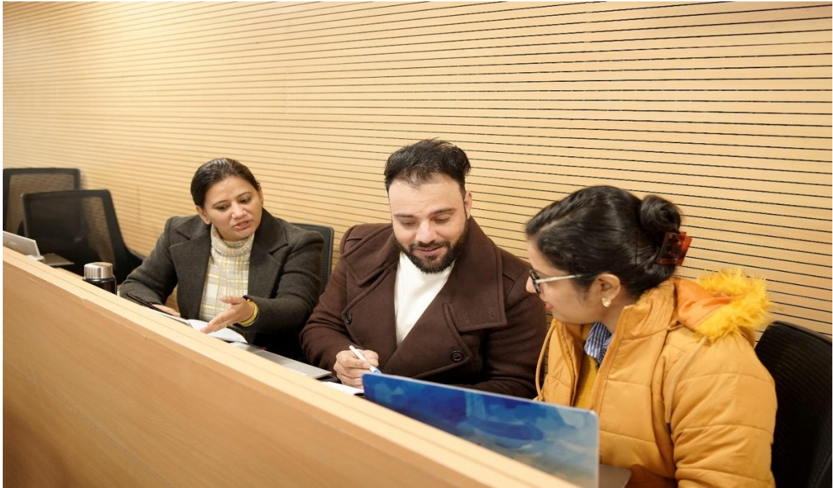
Participants collaborated in teams practiced hand on writing exercises of Case Studies on 9th January, 2025