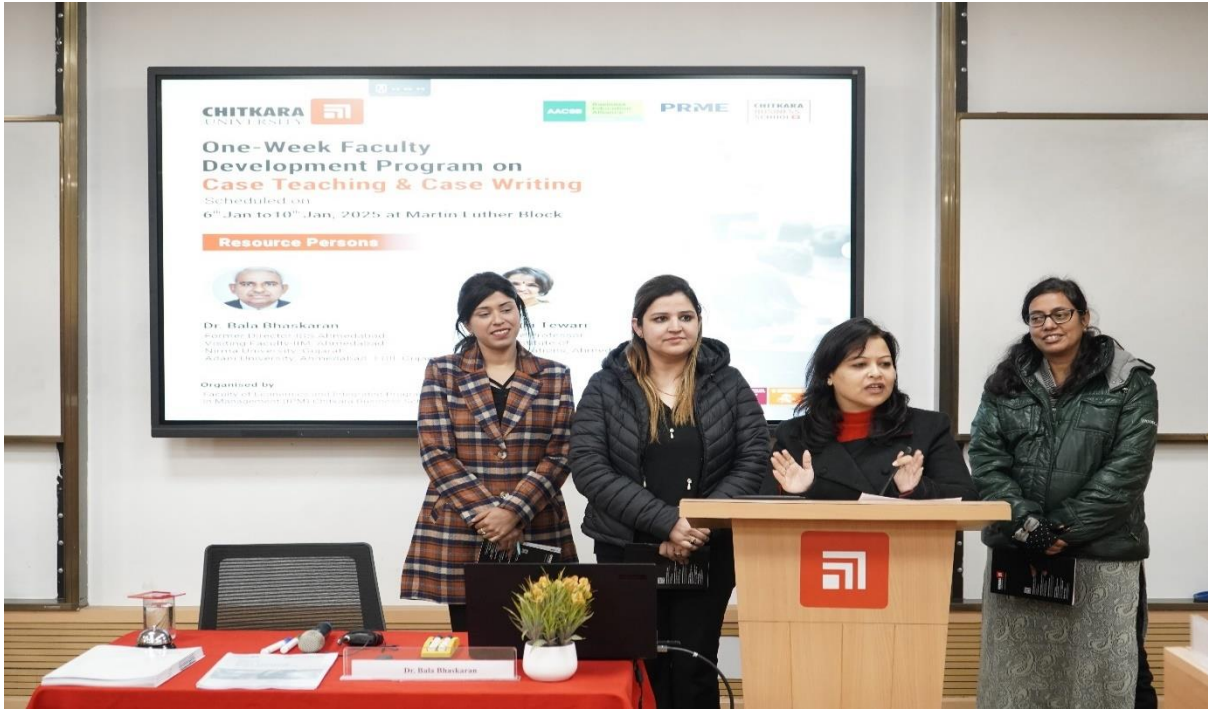
Participants collaborated in Group on Second Day of One-week of Faculty Development Program and exchanged their perspective on Case Studies on 7th January, 2025.