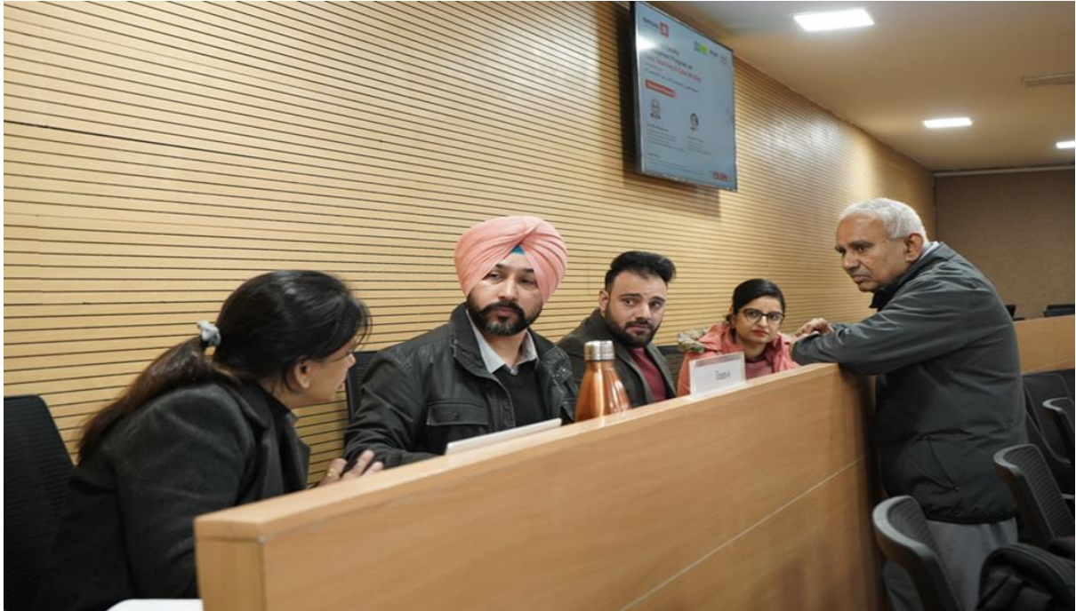
Participants collaborated in Group on Second Day of One-week of Faculty Development Program and exchanged their perspective on Case Studies on 7th January, 2025.