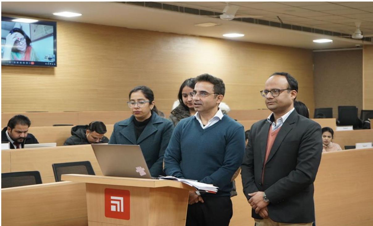
Case Studies Discussion by the Participants on the Third Day of Faculty Development Program on 8 th January, 2025