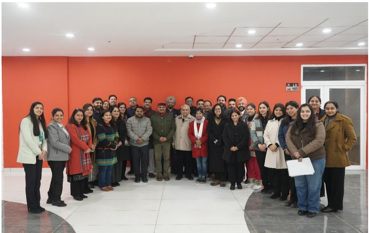
Successful accomplishment of the One-Week Faculty Development Program captured with a group photograph on 10 th January, 2025