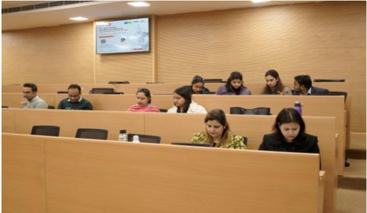
Participants collaborated in teams practiced hand on writing exercises of Case Studies on 9th January, 2025