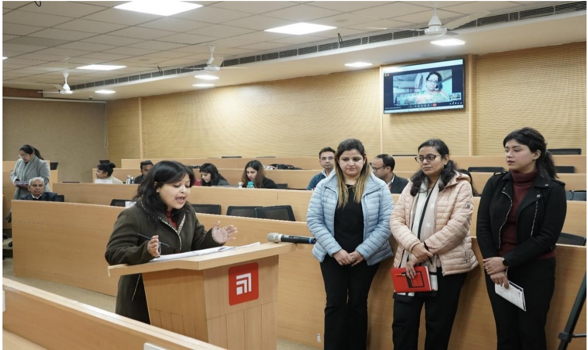
Case Studies Discussion by the Participants on the Third Day of Faculty Development Program on 8th January, 2025.