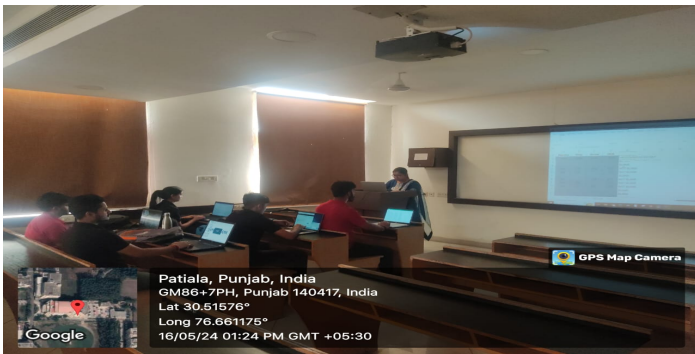
Students performing the task assigned