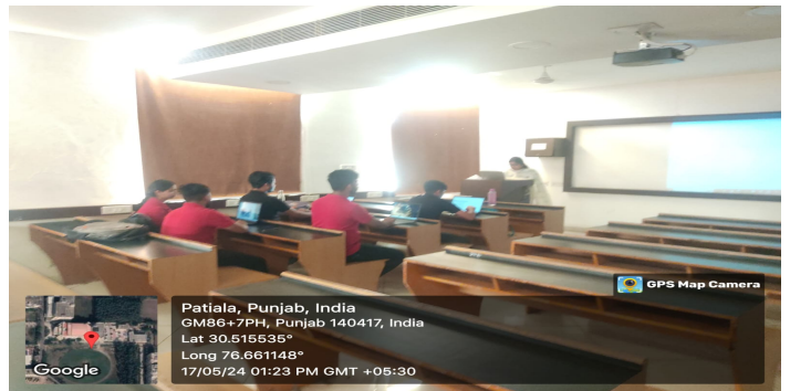
Students giving exam