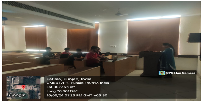
Trainees learning on advanced excel functions