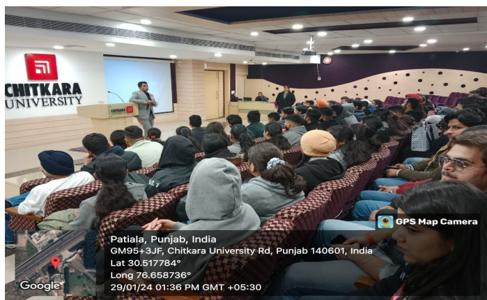
Resource person while answering queries (29.1.24)