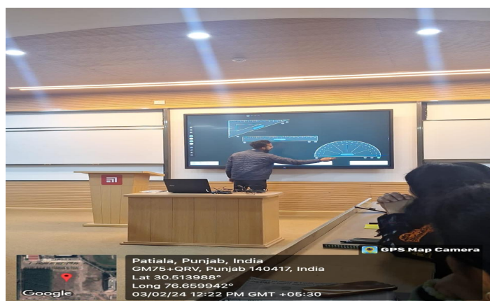
Tech for Teaching : Hands-on instruction empowers faculty to integrate technology into their classrooms . 03.02.2024