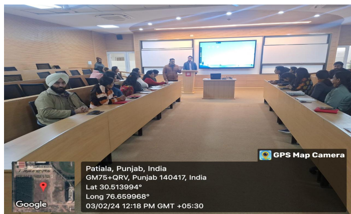
CBS faculty Ready to unleash the creative power of the Smart Board! 03.02.2024