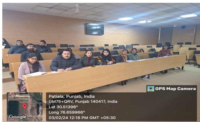
Smart Start : Faculty training underway , exploring the interactive capabilities of the Smart Board. 03.02.2024