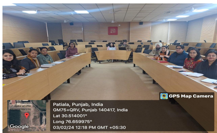
Faculty engaged in a Smart Board training session , enhancing their pedagogical capabilities . 03.02.2024