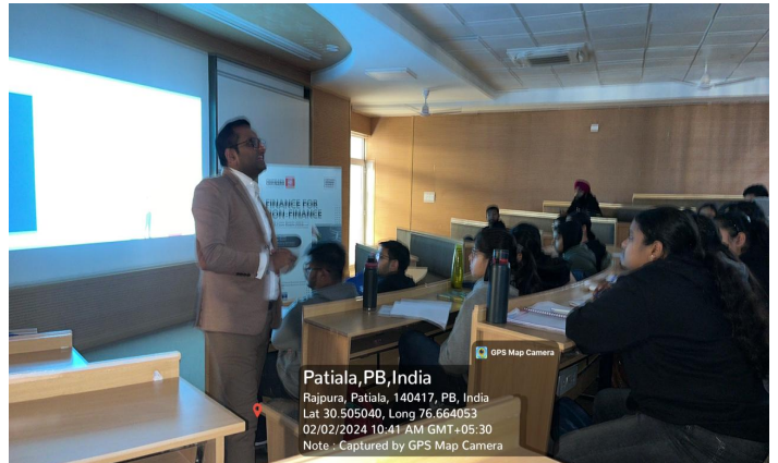
"Unlocking Financial Fluency : From Red Flags to Working Capital Wisdom."