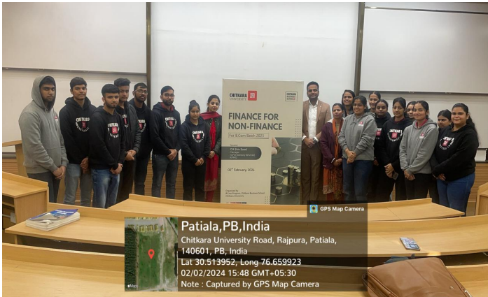
"In the Heart of Finance : Participants Gaining Expertise in FSA and WCM."