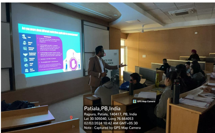
"From Balance Sheets to Red Flags: Capturing Moments of Financial Mastery."