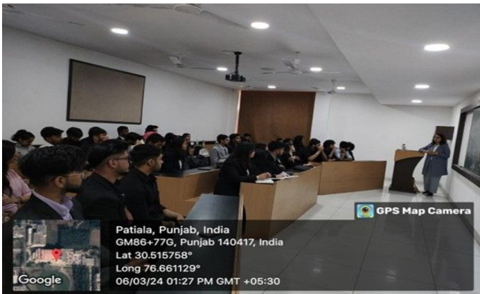
Students are Learning Professional Conduct (06.03.2024 ).