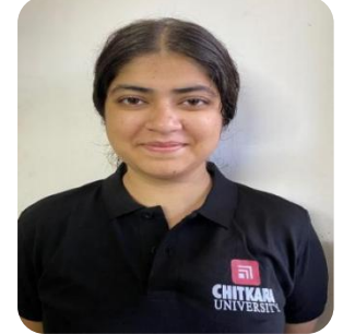
Muskan Talent Team