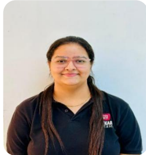
Srishti Student Coordinator